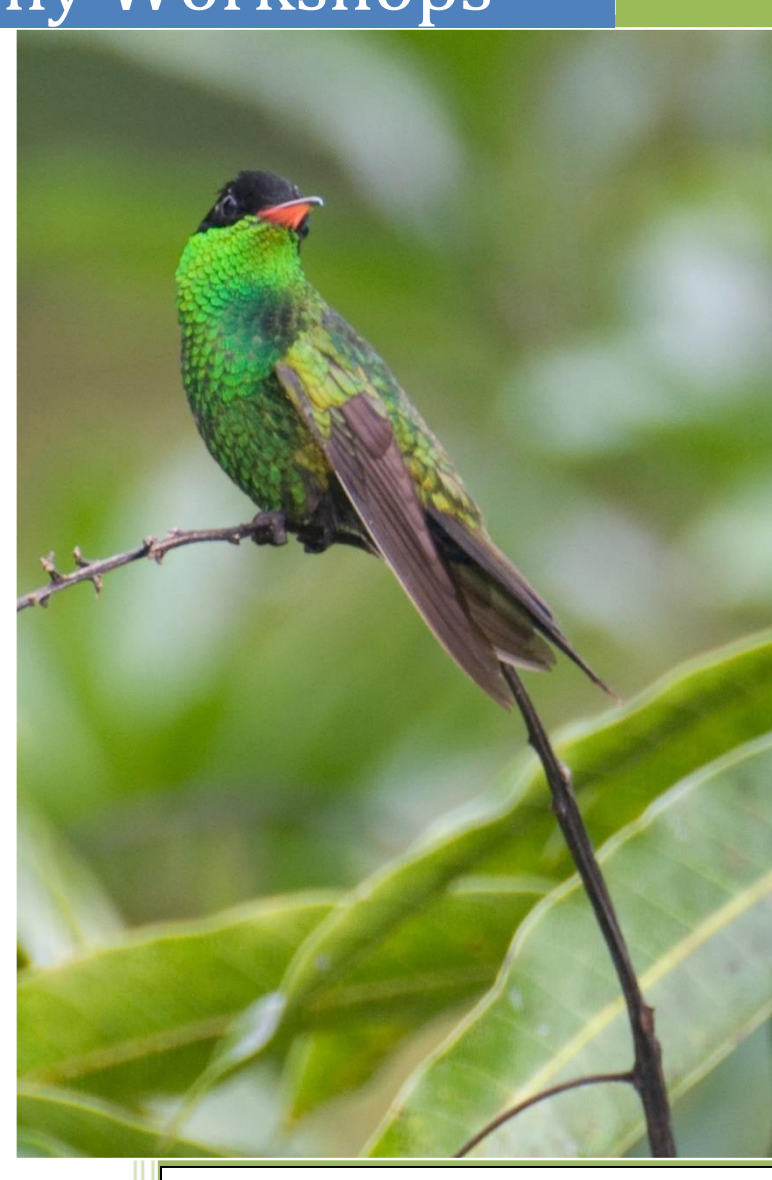
July 2024