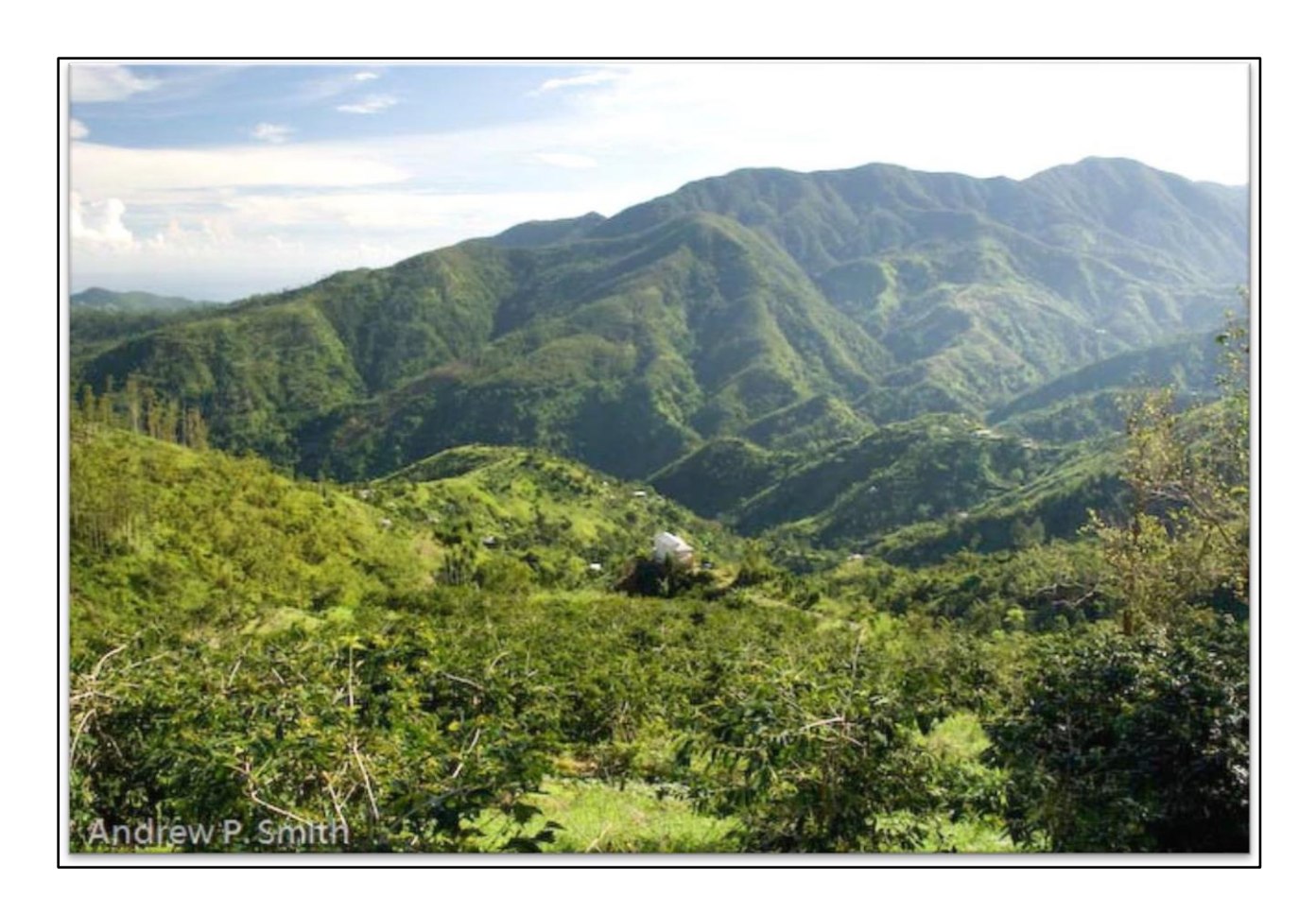
A view of the upper Buff Bay Valley on a hiking trail from Holywell to Cascade