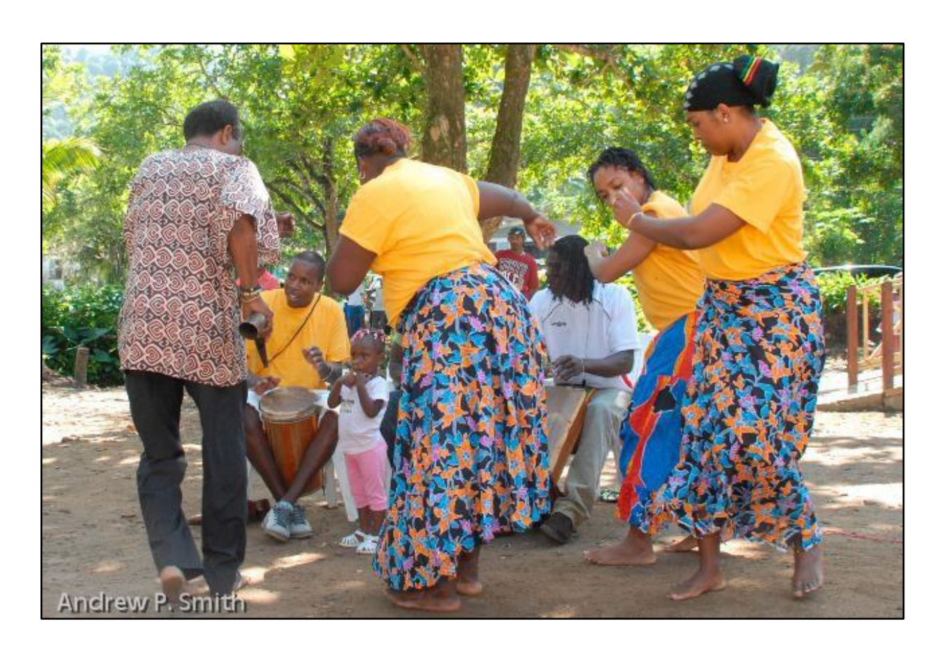
The Charles Town Maroons of the lower Buff Bay Valley