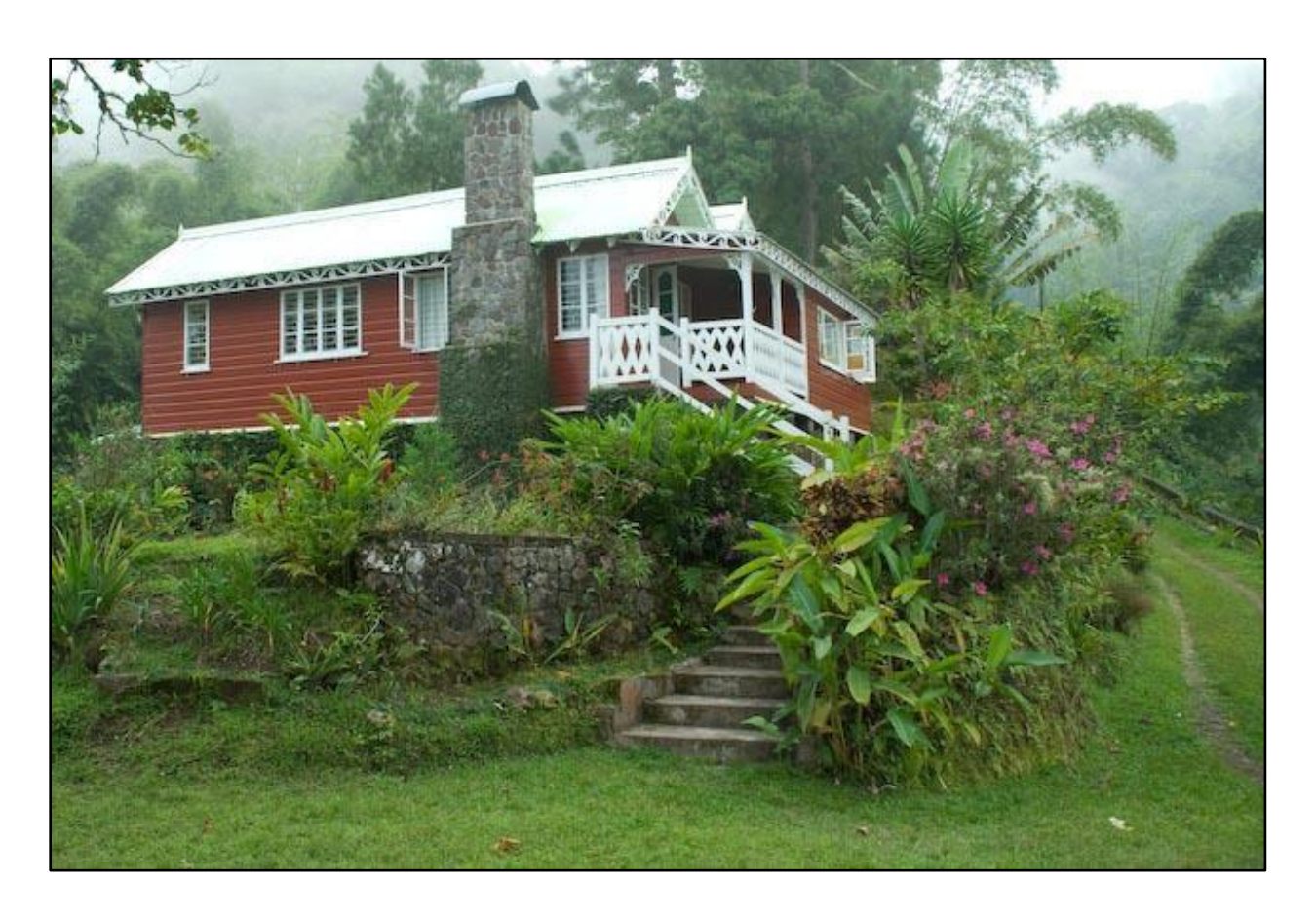
River Breeze Cottage. Cascade, Portland

River Breeze Cottage is a unique retreat located in Jamaica's verdant Buff Bay Valley where photographers can immerse themselves in their craft via workshops designed and presented by photographer and educator, Andrew P. Smith.