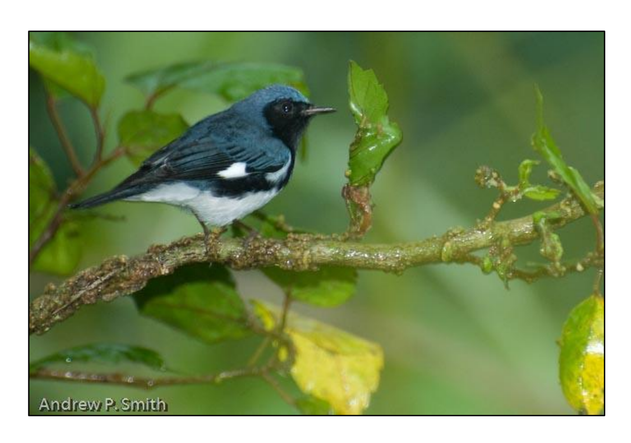
A male Black Throated Blue Warbler, photographed on the grounds of River Breeze cottage